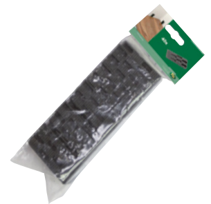
Packing spacers, 40 pieces