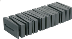
Spacers, 30 pieces